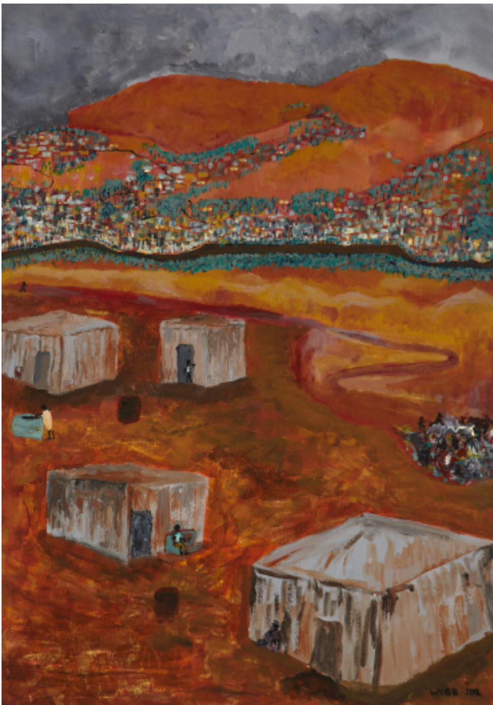
Brad Webb Black Estate 89.5 x 80 cm acrylic on 4gsm paper

3 Research the Aboriginal Protection Board and list 2 reasons for and 2 reasons against its value in creating and sustaining communities and townships. (cultural)