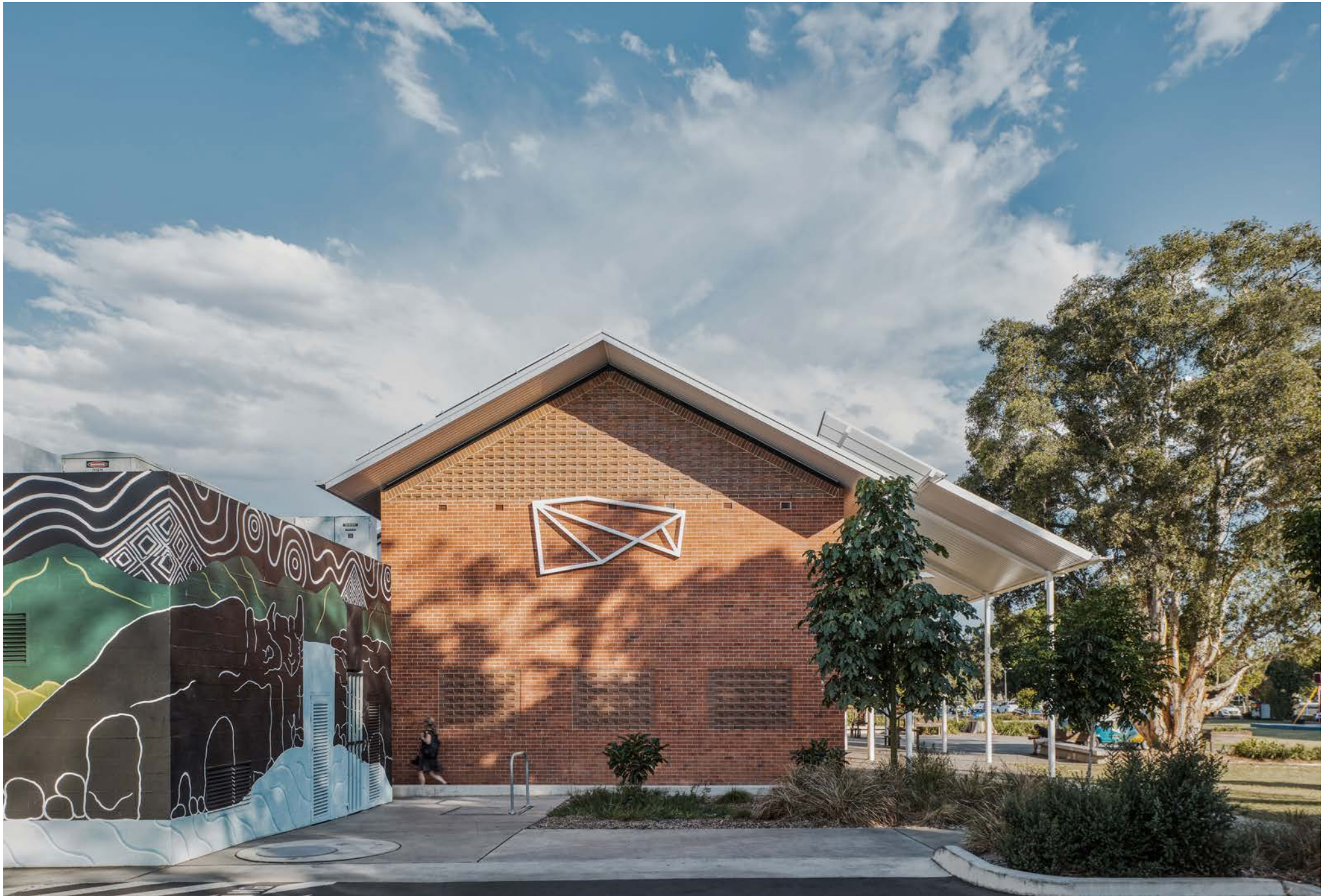
Lismore Regional Gallery, 2018.