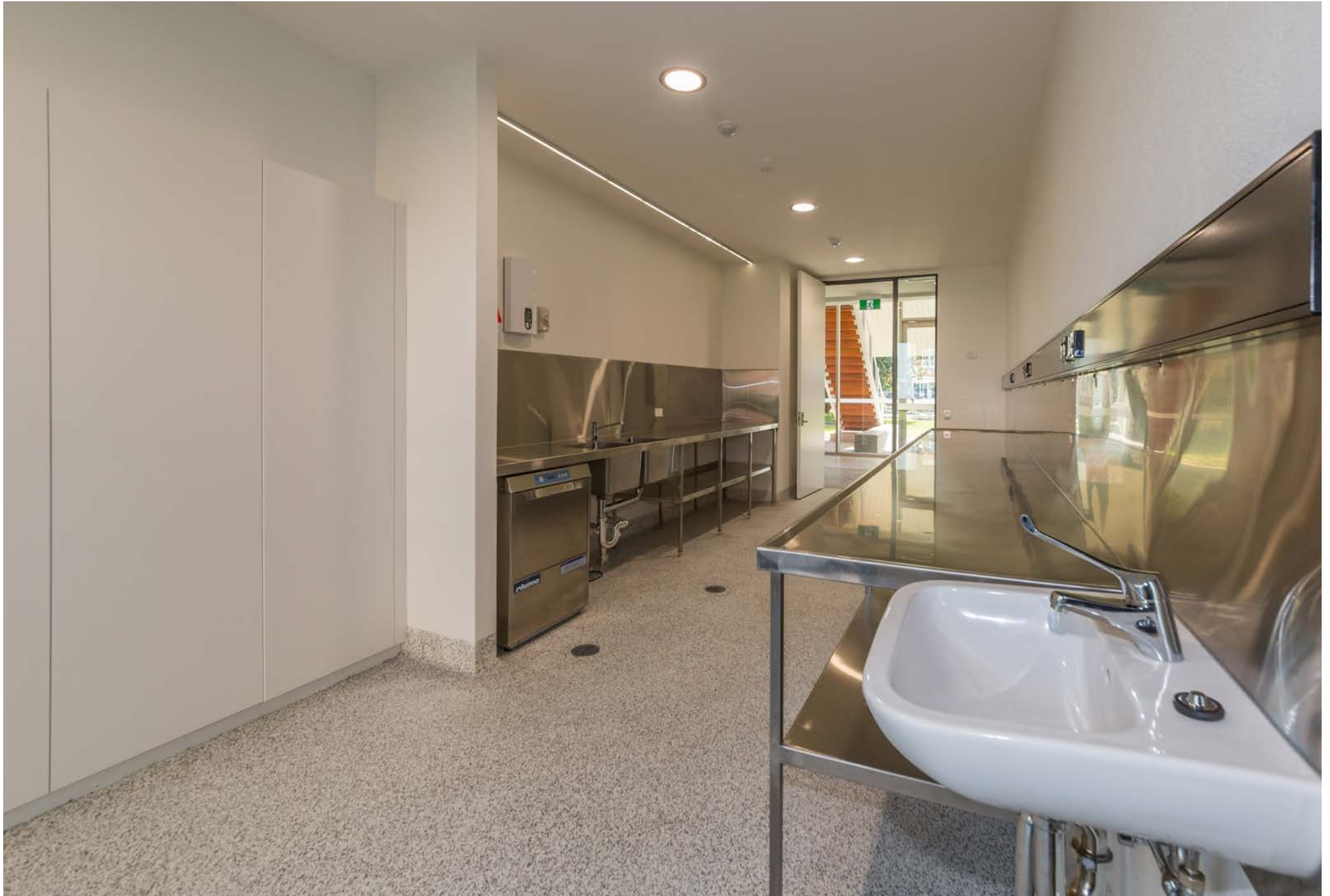
Lismore Regional Gallery kitchen, 2017.