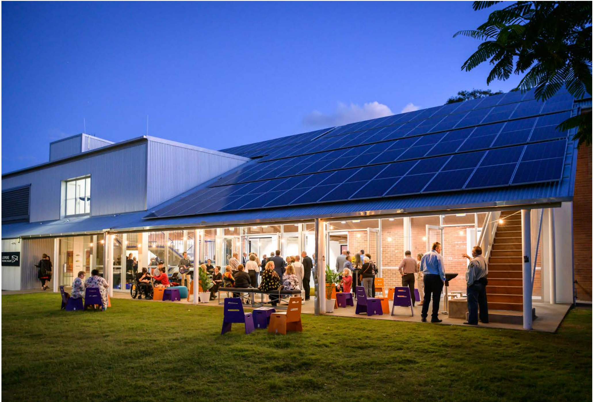
Opening of the 2018 Archibald Prize, 2019.