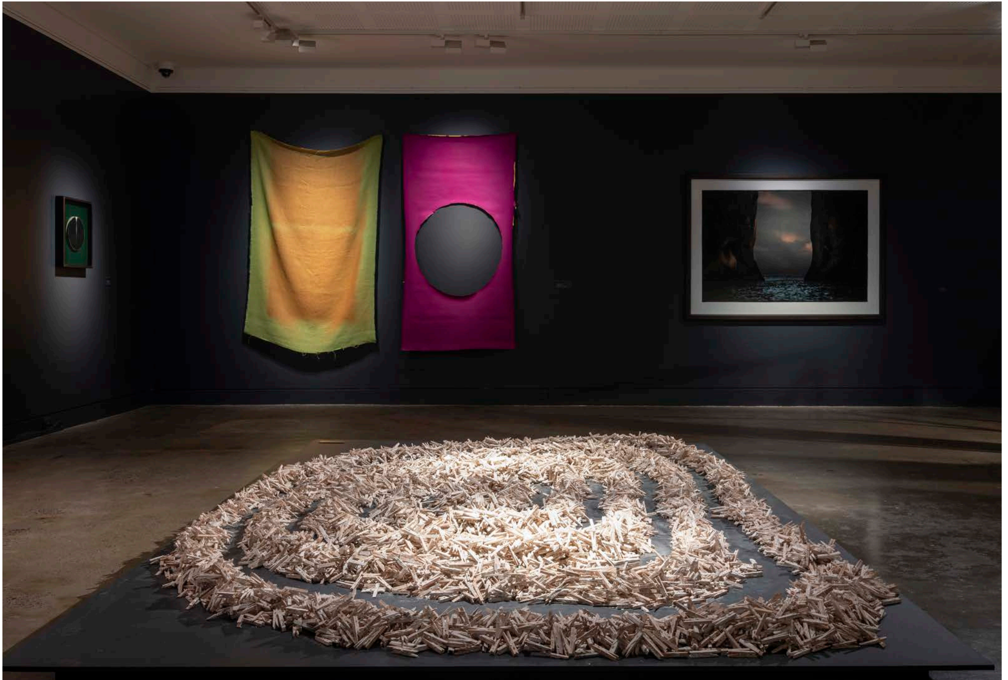
Front cover: Lismore Regional Gallery opening night, 2017. Photo: Kate Holmes; this page: Idle Worship exhibition installation, 2019. Photo: Carl Warner