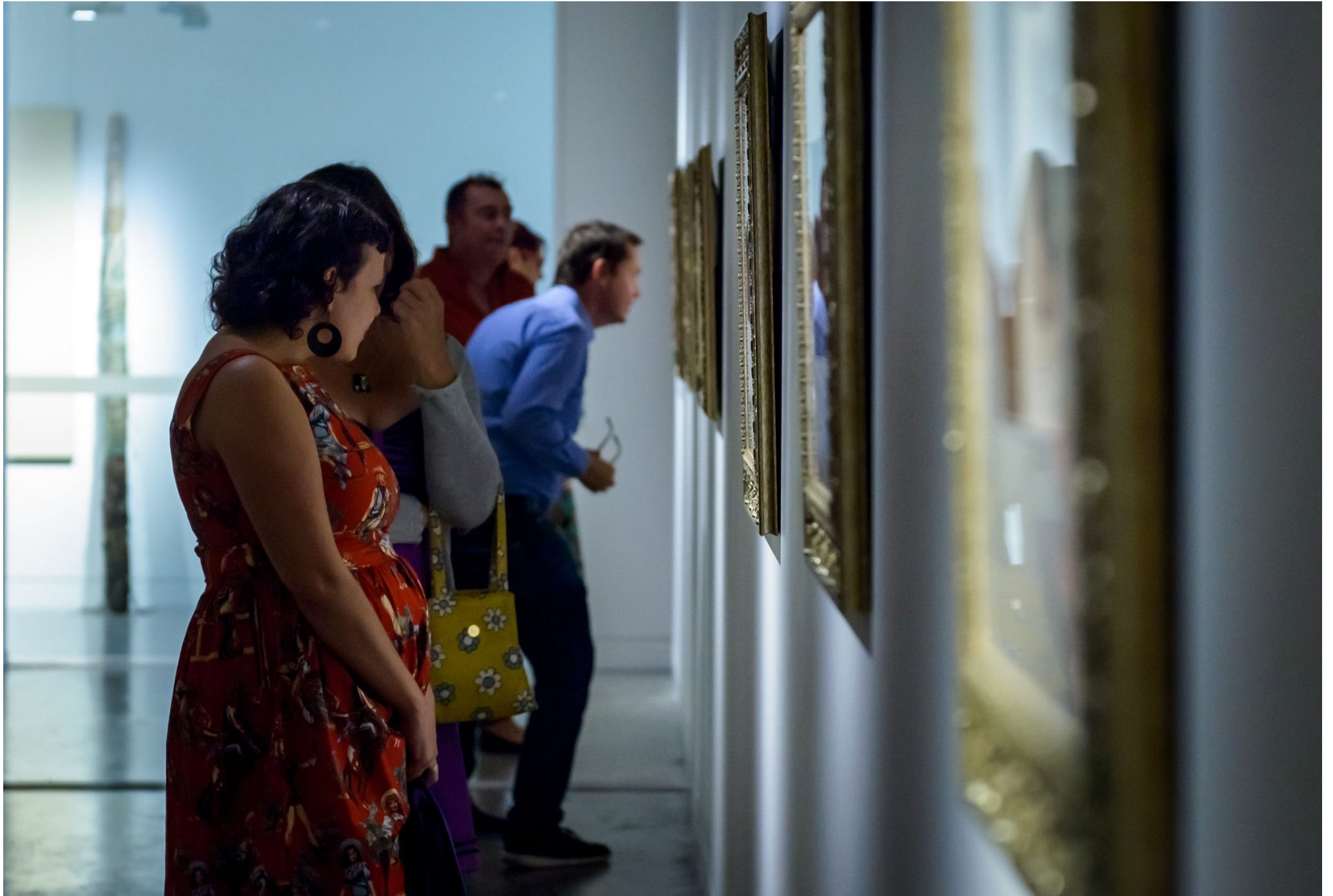
Opening of Beguile: European Masters: 17th - 20th Century , 2018.