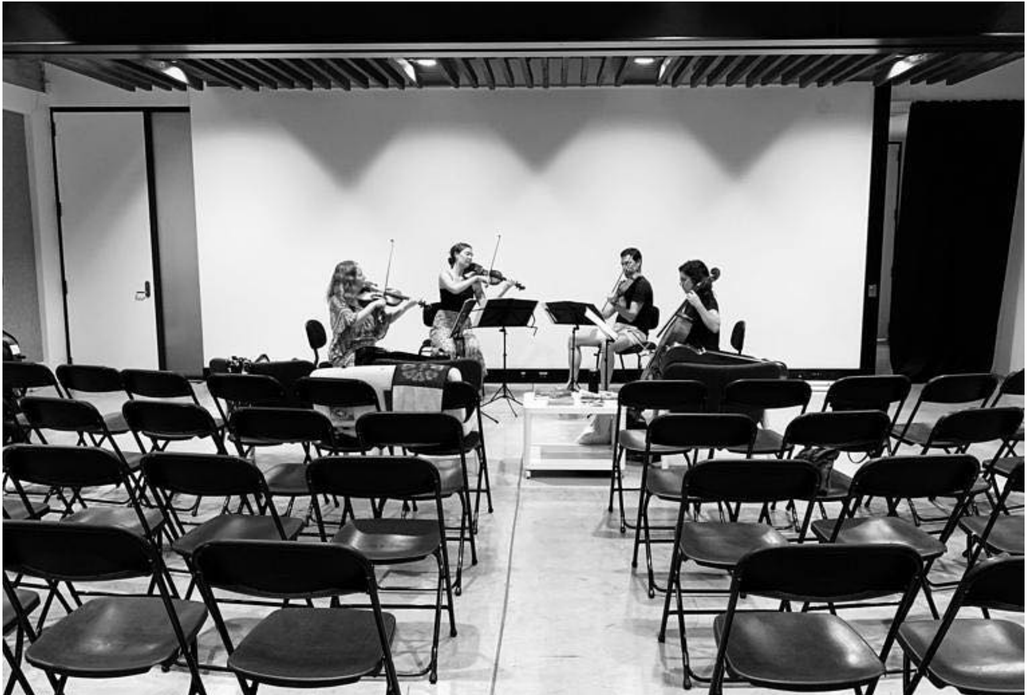
Australian Haydn String Quartet warming up before a performance, 2018.