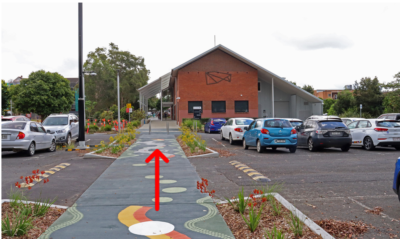
View of the Gallery from Harold Fredericks car park

Arriving at the Lismore Regional Gallery