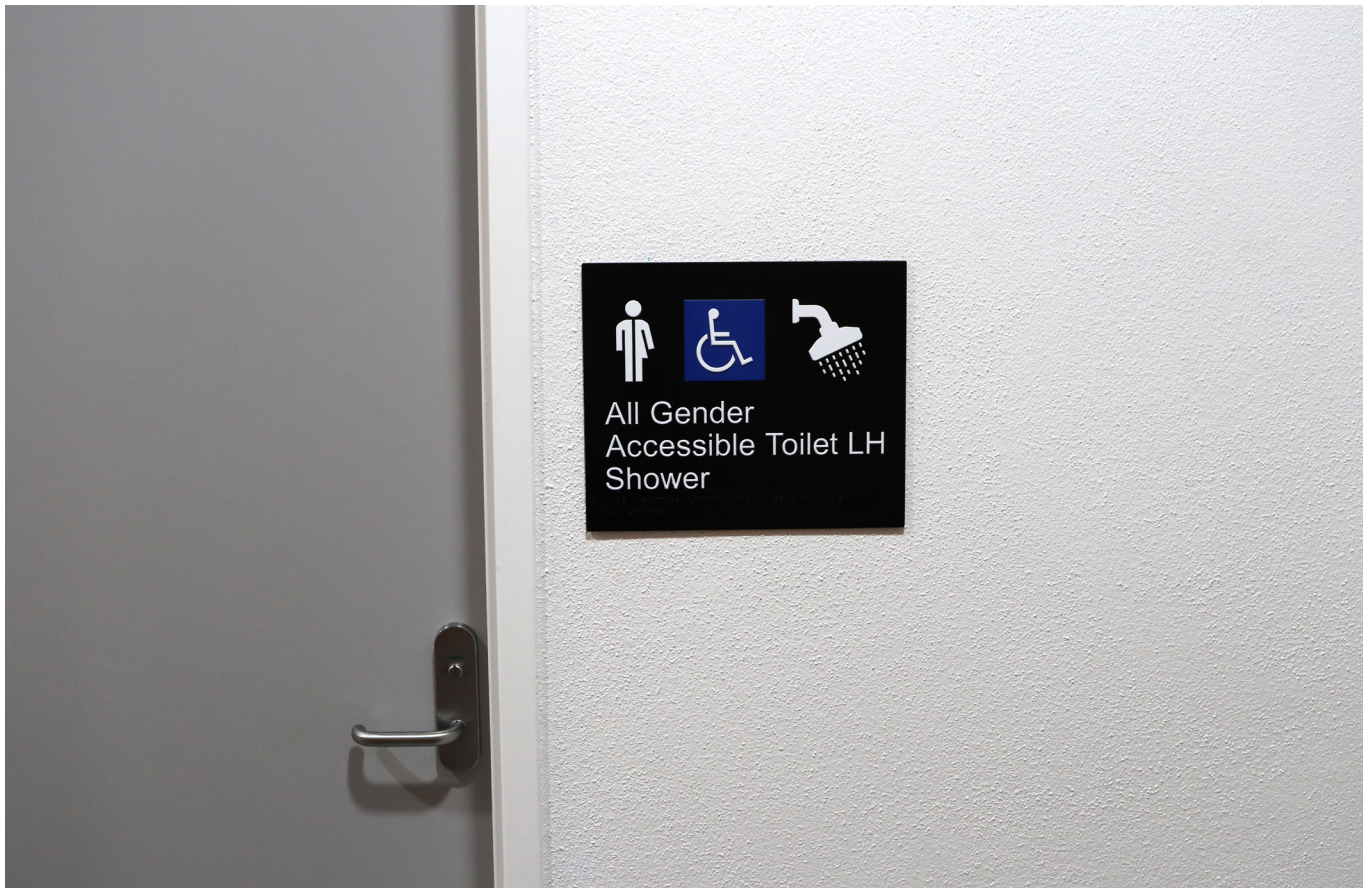
Accessible and gender neutral toilet on the ground floor