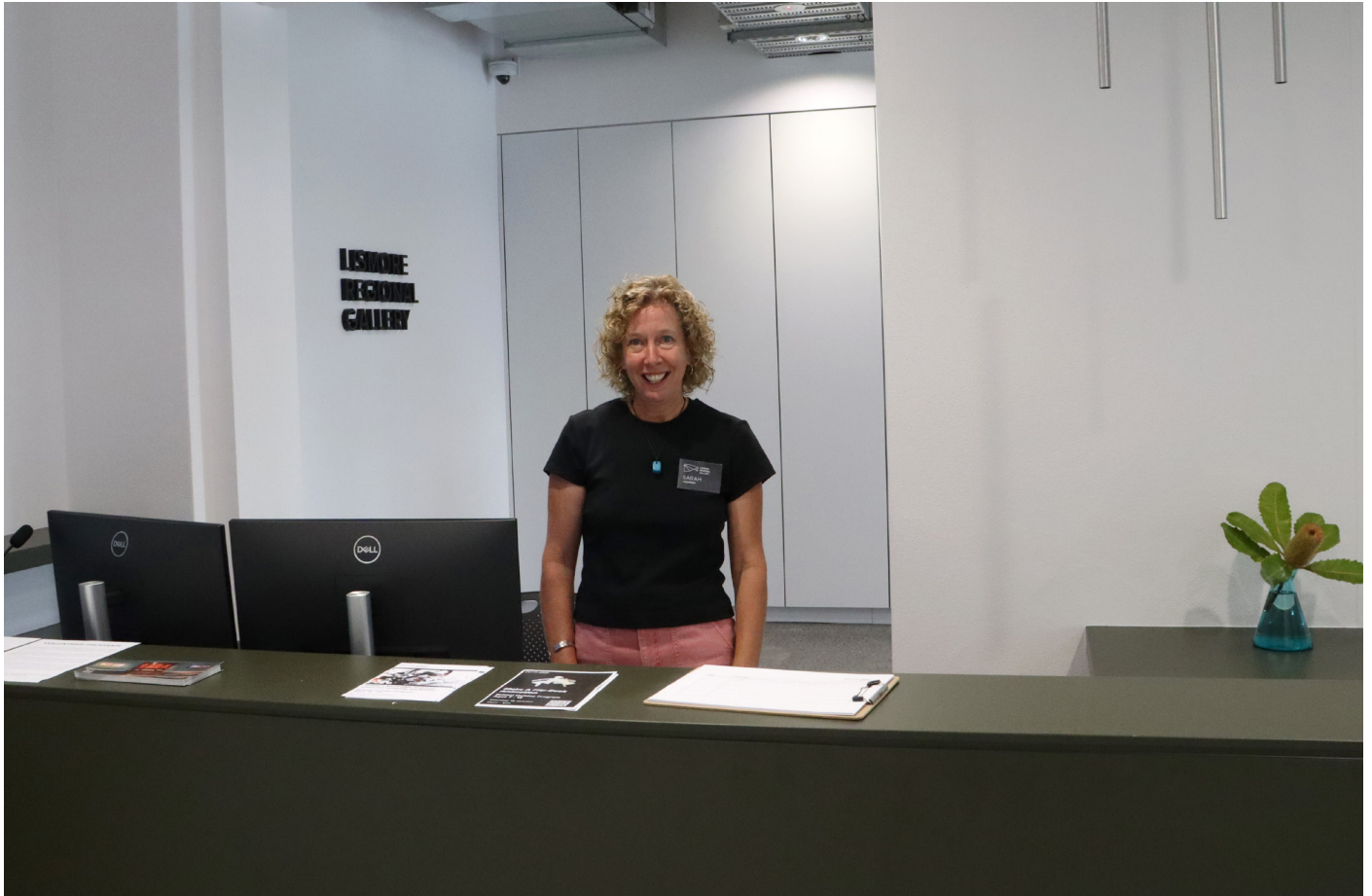
Front of house volunteer

At the front desk there will be a volunteer to greet you. They will be wearing a name tag. You can ask the front desk person for help if you need it.