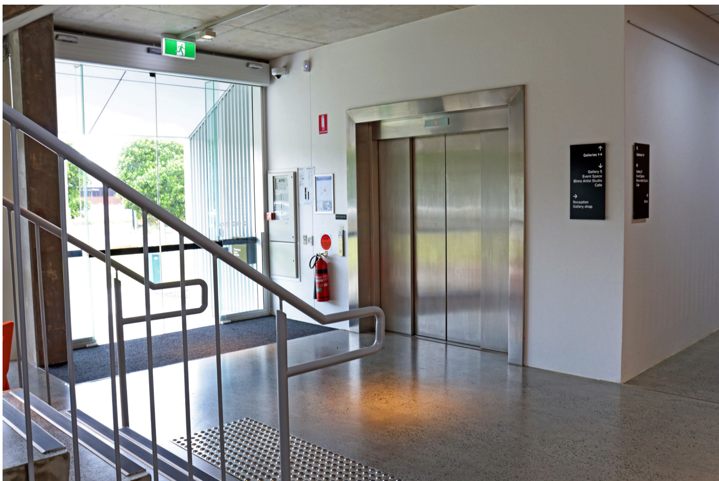
View of the stairs and lift on the ground floor