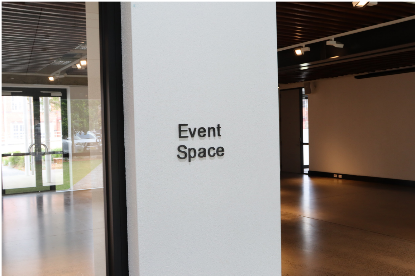
View of the Event Space from the corridor on the ground floor