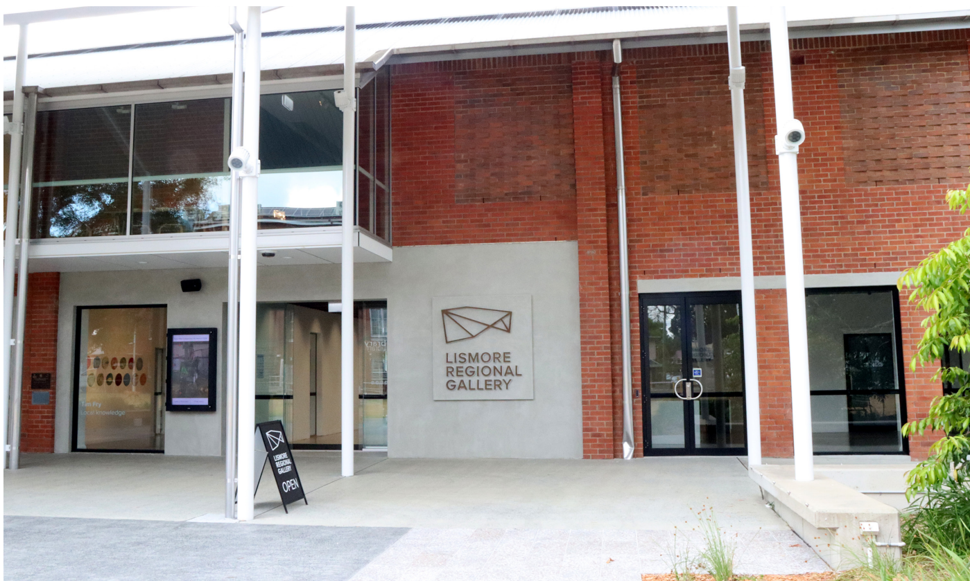
Lismore Regional Gallery entrance

Entry is off the Lismore Quadrangle (green park).