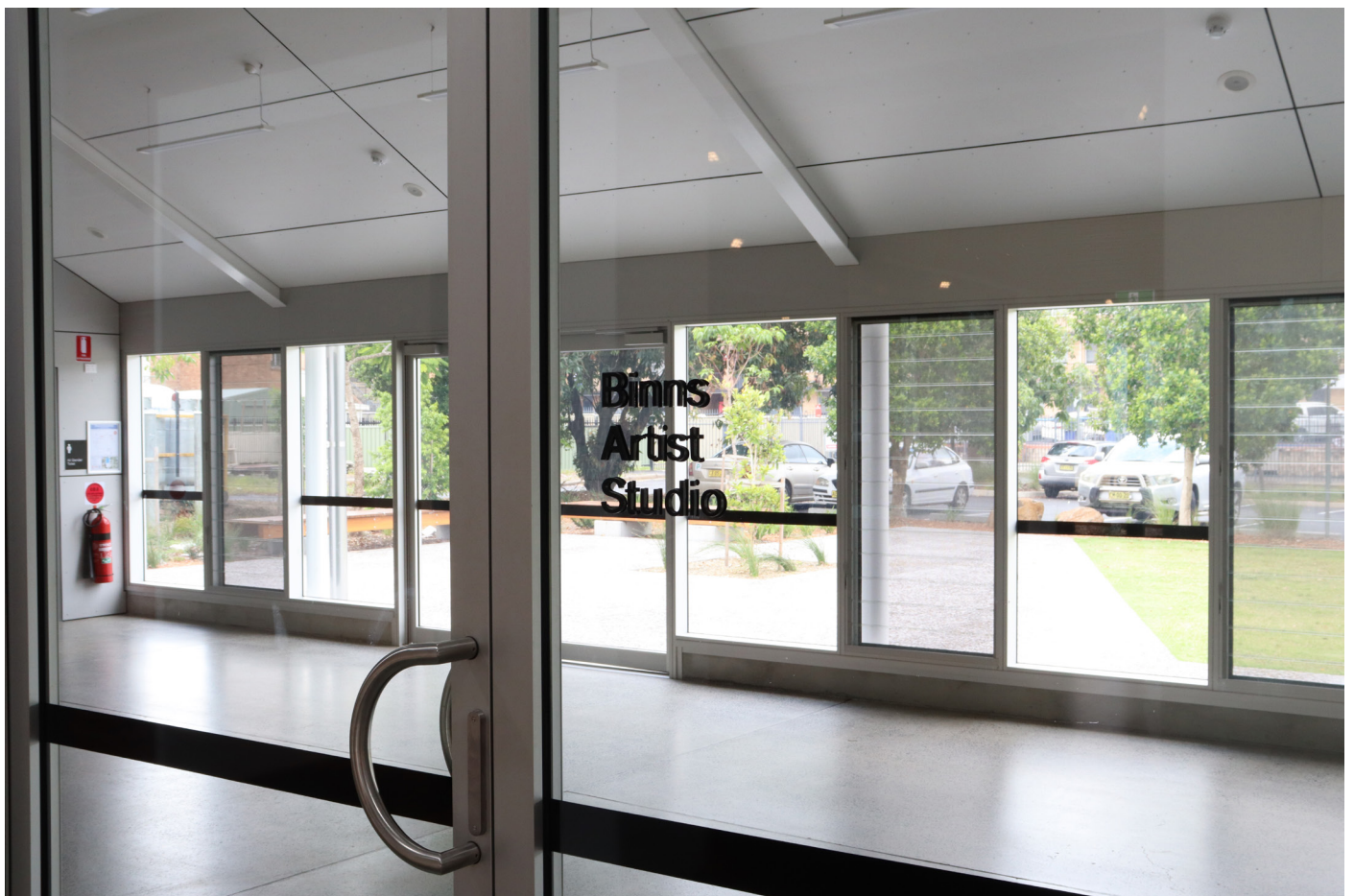
View of the Artist Studio from the corridor on the ground floor