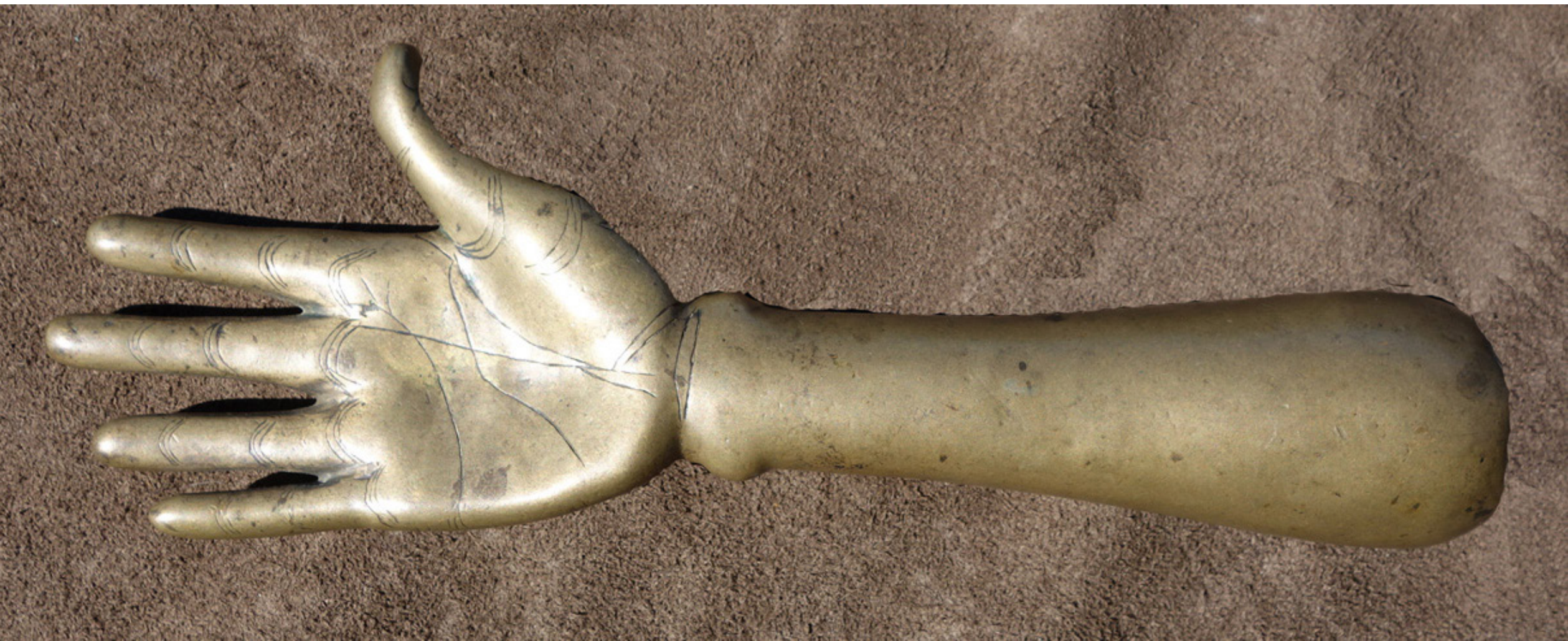
Sati, Devotional object c.18th Century India bronze Collection of Robert Bleakley