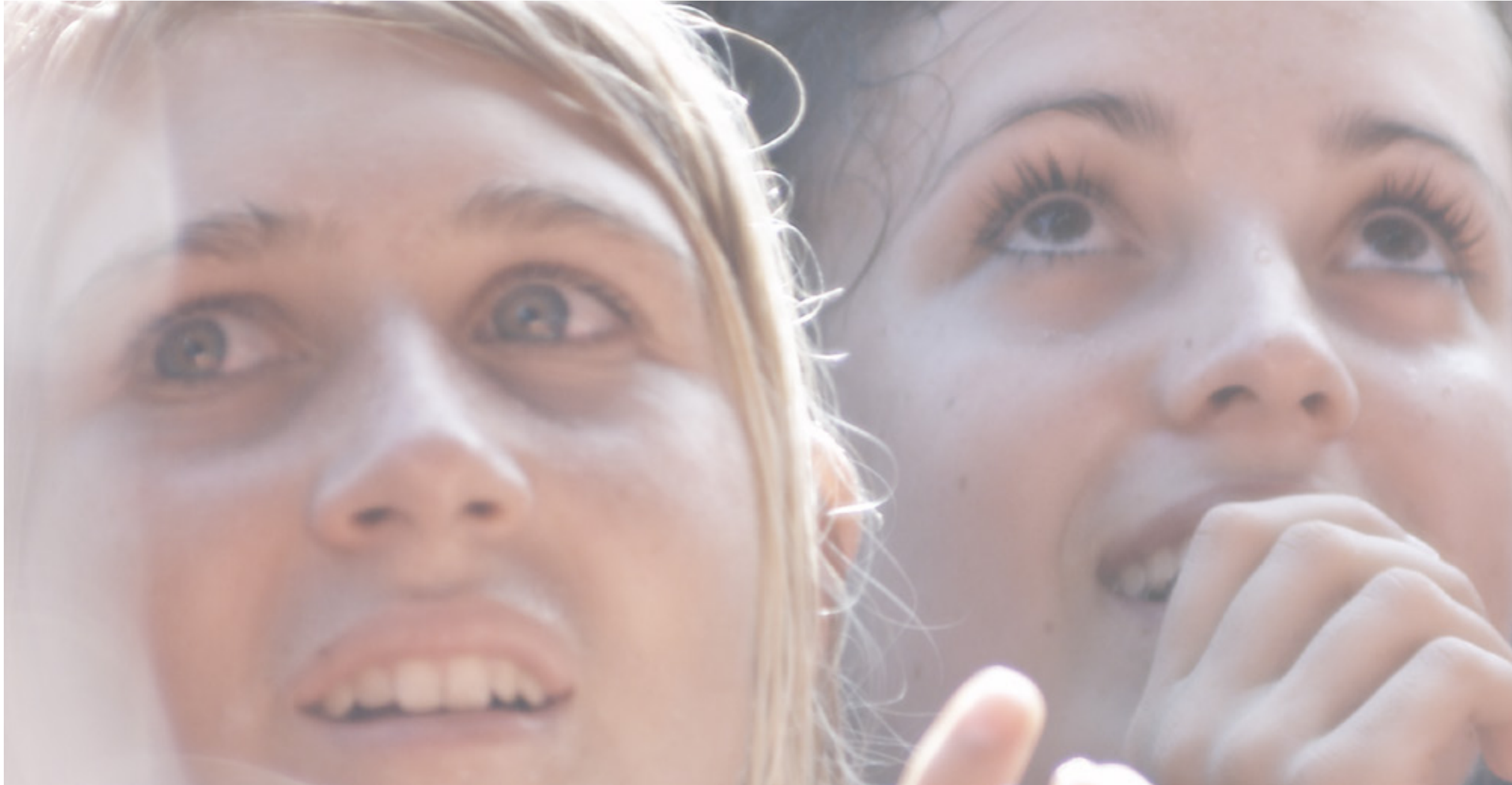
Angelica Mesiti Rapture (silent anthem) 2009 film still, Australian High Definition Video, silent, 10 mins 10 secs duration 09