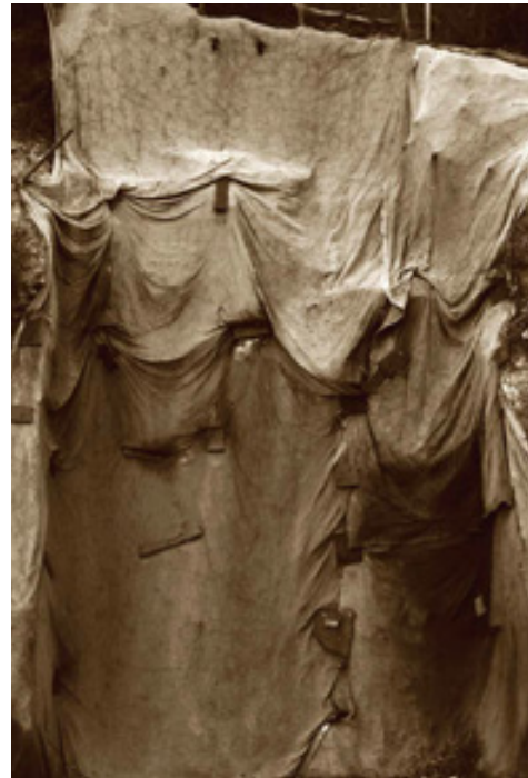
image left and right: Nicole Foreshe belong to all yet to none , 3 2012 (film still) single channel video silent 30 minutes duration

purposeful yearning. Vanity – but a modest coquettish vanity – a display of affection and tenderness beyond words.